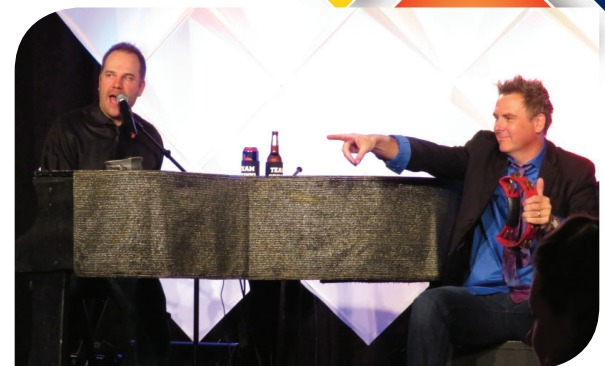
Entertainment by Deuces Wild! Dueling Pianos